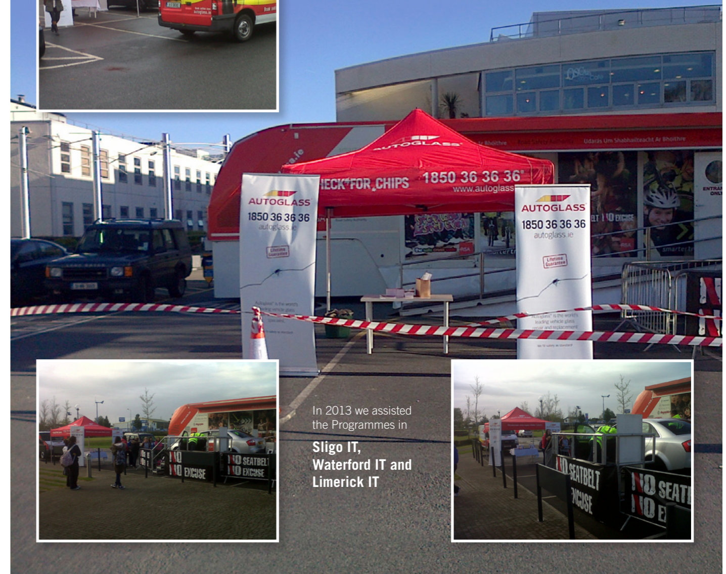
In 2013 we assisted the Programmes in Sligo IT, Waterford IT and Limerick IT